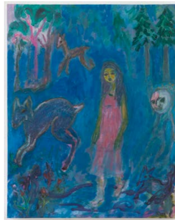
Image: Song of Amergin oil on canvas 91.5 x 76 cm