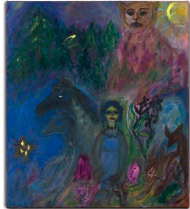
Image: Other Voices oil on canvas 91 x 122 cm