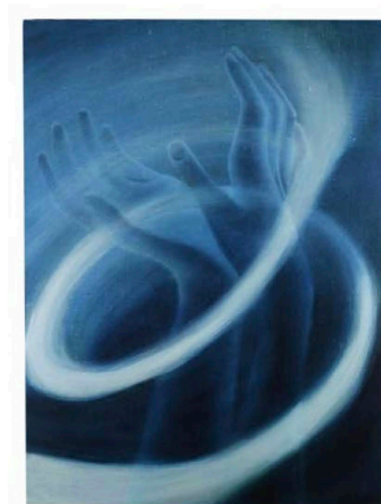
Image: The infinite sadness oil on linen on wood 50 x 32 cm